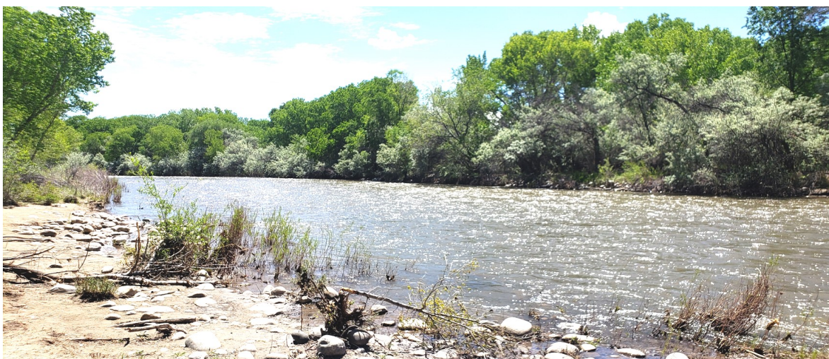
Animas River—Farmington, NM

To view the resource document, please visit: https://www.epa.gov/wqs-tech/options-modernizing-public-hearings-water-quality-standard-decisions-consistent-40-cfr-255 .