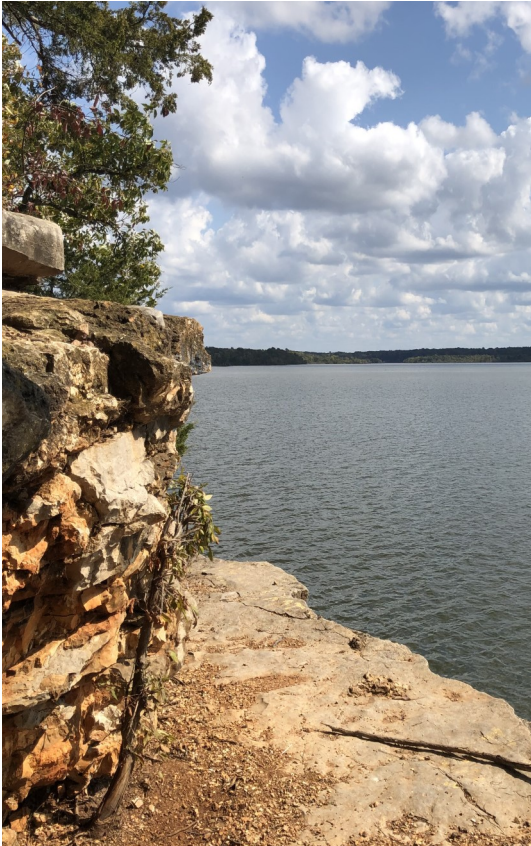
Photo: Scenic overlook of the Elk River branch of Grand Lake, this site is located on Seneca-Cayuga ceremonial grounds that border it.