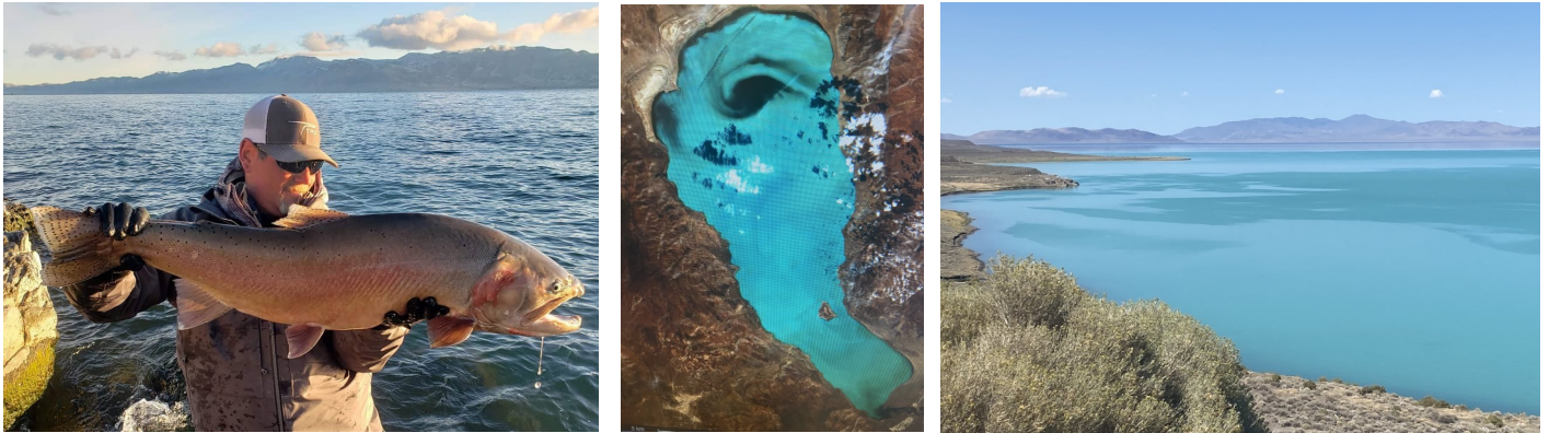
Photos: Lahontan Cutthroat Trout (left), Satellite image of Pyramid Lake (middle), and Pyramid Lake (right)

collaboratively with partners to protect, conserve, and restore aquatic resources, fish habitats, and water quality within the Pyramid Lake - Truckee River watershed. This can be achieved if a balance can be found to maintain the Tribe's goals, while meeting the demand of upstream users of the Truckee River. This provides a unique opportunity to add a significant education feature to the general public.